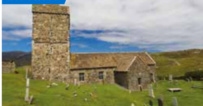
St. Clement's Church

Soon you will reach a small side road branching off to the left signposted ‘The Golden Road’. Turn left along this, avoiding the long climb ahead on the main road, and swoop downhill into the little village of Miabhaig. This is the first of many villages you will pass through on the Golden Road, so called because its tortuous route through the intricate landscape of the Bays of Harris made it extremely expensive to build. Before its construction in the 1940s, all traffic between the villages went either on foot or by boat.